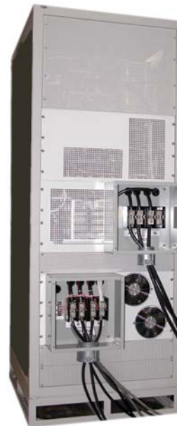
Shown with junction box cover removed

Output Connections: Four pressure terminals: A, B, C, N